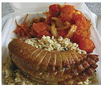
Fried Ahi Belly