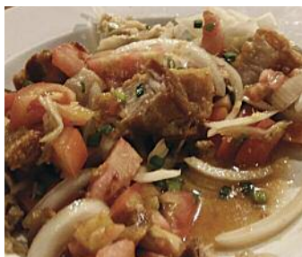
Lechon Kawali · Kim Chee