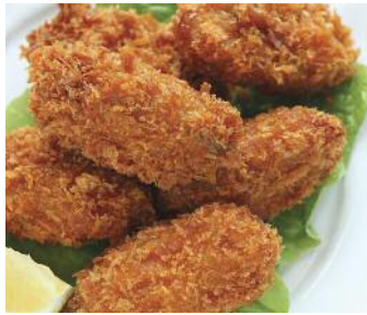
Deep Fried Oysters

8 oz. Sirloin Steak, Fried Oysters, Ahi Sashimi, Baby Back Ribs, Garlic Shrimp