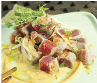
Seared Fried Poke